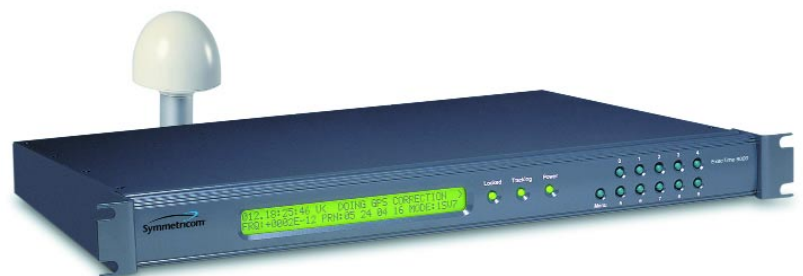
FIG.1 ExacTime GPS Time & Frequency Generator

The basic unit provides six output BNC ports and one input BNC port. The six output ports are user selectable via box pin jumpers and front panel controls to generate frequency (10 MHz), pulse rates (1 PPM to 10 MPPS) and time code (IRIG B). Other frequency and time code outputs can be optionally added. A front panel LCD panel gives the user a simple and intuitive control interface. Remote control software for Windows is included upon request.