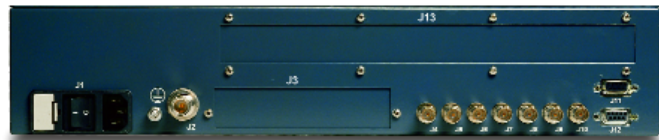
J11 = Printer Port J12 = Input / Output Port