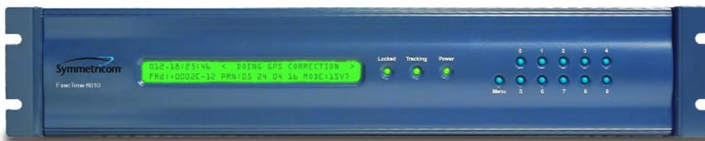
FIG.6 ExacTime 6010