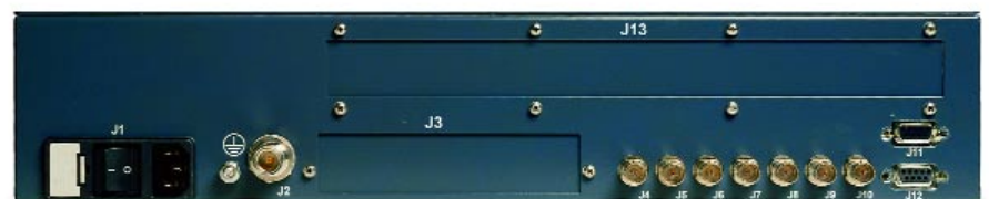
FIG.7 ET6010 (2U chassis: 3.5"/8.89 cm)